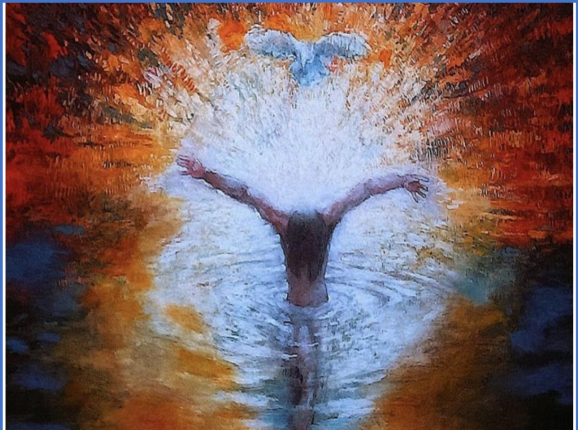
An excerpt from the Companion to the Book of Common Worship (Geneva Press, 2003, 148)

The Baptism of the Lord is closely related to Epiphany and should be considered in relation to that feast. Jesus' ministry to bring in God's rule was inaugurated in his baptism. As he came out of the water, the Spirit rested on Jesus and a sign of God's approval was heard. On this day, we celebrate not only Jesus' baptism but our own as well, for our baptism is rooted in Christ. Baptism joins us to Christ and his church, and with all of the baptized we are called to share in Jesus' ministry. In the waters of baptism we are buried with Christ, cleansed of our sins, and raised to share in his resurrection. The Spirit is given to us and we are declared the children of God.